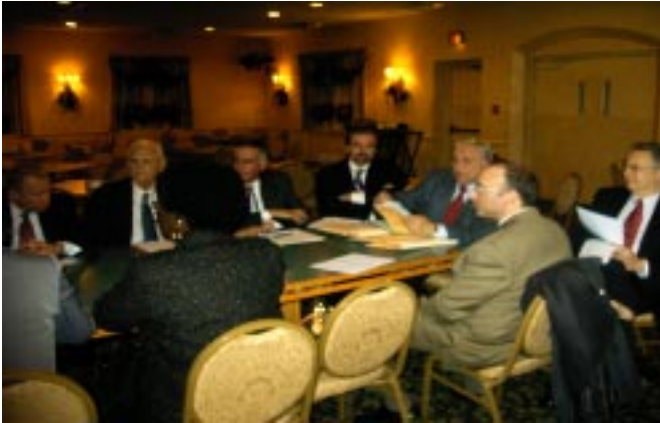
Your executive board busy at work.